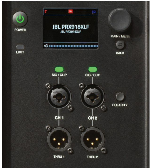
REAR PANEL CONNECTIONS

The JBL PRX918XLF , part of the JBL PRX900 Series powered loudspeakers and subwoofers, takes professional portable PA performance to a new level with advanced acoustics, comprehensive DSP, unrivaled power performance and durability, and complete BLE control via the JBL Pro Connect app.